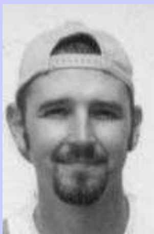
All about the bagels