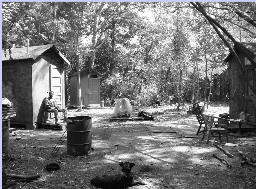
Law camp, autumn 2003.