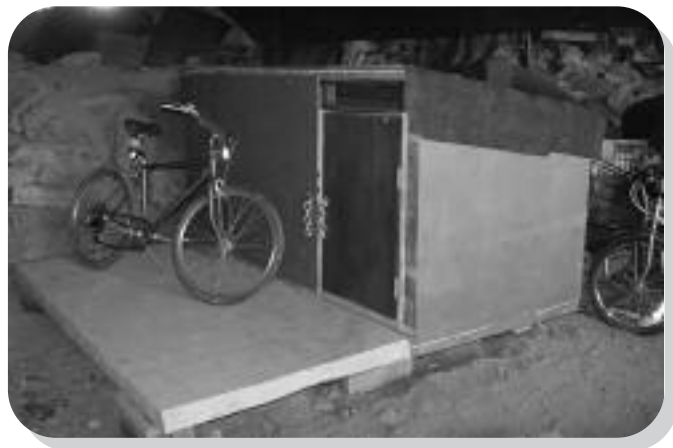
... to a campsite

Due to the sleeping unit's limited space, a separate lockable storage unit is provided. The storage unit's construction is similar to the sleeping unit except that the floor